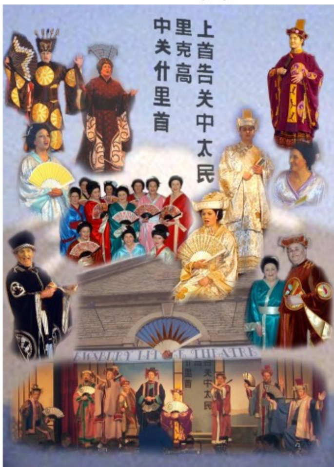
The programme and scenes from our 2005 production at the Little Theatre