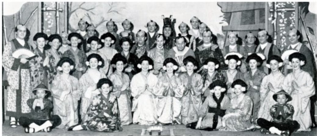
The cast of our 1968 production at Hanover Street Congregational Church